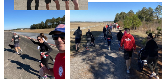
Virtual 5K participants across the nation