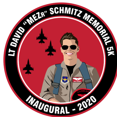
Commemorative 2020 5K Patch